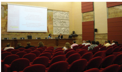
Conference Hall at the Asti Chamber of Commerce

The Asti University of Economy presented the analysis done in the industrial areas of Nizza Monferrato, Canelli, and Calamandrana (municipalities in Asti Province). Afterwards, experts from Moncalieri municipality (Turin Province) provided a presentation on their territorial experience and their strategy in developing a polycentric settlement in Vadò industrial area through the creation of a consortium of enterprises.