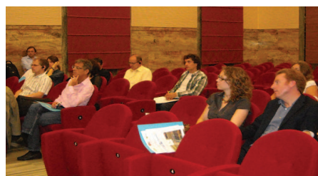
Project partners at presentation session

implementation; the second half was dedicated to evaluating single aspects of inter-municipal commercial location development. The group intensively discussed the structure of the Guidelines on Inter-Municipal Commercial Location Development (CLD), trying to redefine and distribute the written contributions among partners.