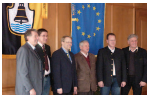
Mayors in Alpsee-Grünten region

The four mayors accept the decision of Immenstadt's City Council, which voted against the city's continued participation in the joint project. On the one hand, having Immenstadt aboard would have been a sensible move given the high level of interdependence of the economic region to which all municipalities belong. On the other hand, this ambitious project requires a high degree of conviction.