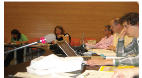
Workshop session

The project team then focused on the implementation of the dissemination and knowledge management system, assessing the work accomplished so far and the planned strategies to ensure project sustainability. The first work day ended with the presentation of project promotion material, a discussion about the final conference and an exchange of view about the contents and technical aspects of two publications: the Project Synthesis Booklet and the Popular Scientific Fi-