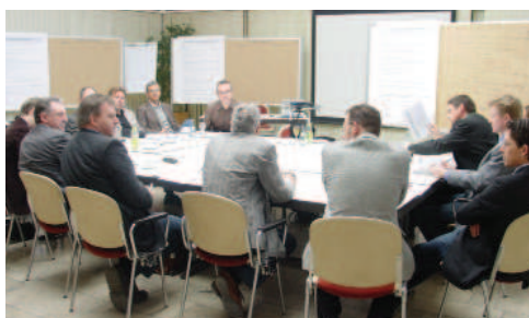
Workshop in Alpsee-Grünten

primary reason for Immenstadt's decision to discontinue its participation is an expected imbalance of costs and benefits between the municipalities according to the amount of area they bring in to the project. This concern is only partially understandable. Indeed, according to the jointly developed concept, Sonthofen and Immenstadt were expected to contribute very similar amounts of land during the first ten years of the cooperation.