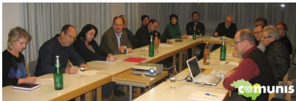
Working group meeting with all mayors in Lochau, 03.02.2011