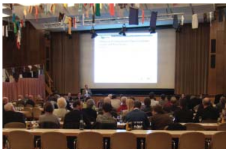
Joint informative meeting for town and city councillors of the Alpsee-Grünten region.

but rather the preservation of a “regional” labour market where the job offer is ensured and improved for the population of Alpsee-Grünten.